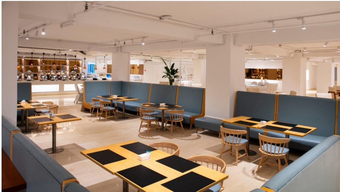
3.4 Western Restaurant 云水间 | 湖畔西餐