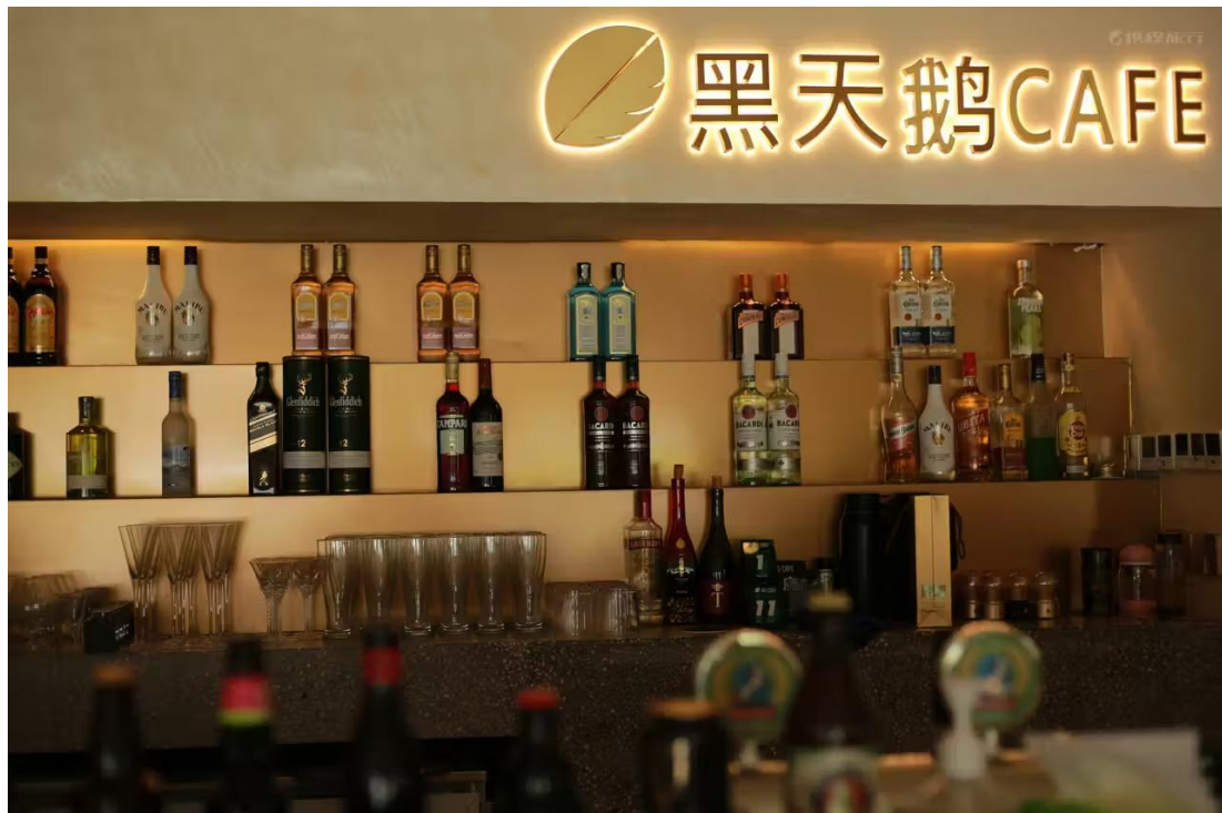
3.5 Black Swan Coffee 黑天鹅咖啡馆